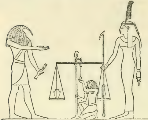
HORUS WEIGHING THE HEART IN THE UNDERWORLD.*

soul in the underworld before the throne of Osiris. Otherwise she is the personification of truth and right, but the abstract idea of the term has been and has always remained